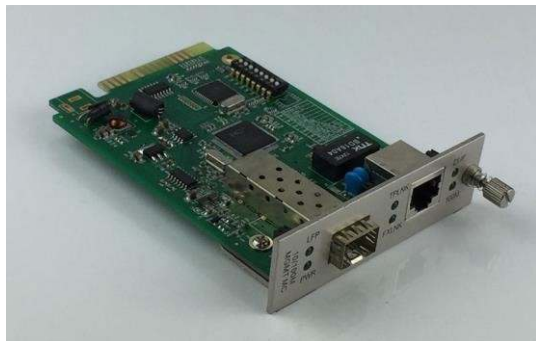
Card with SFP slot(AZ03-100M-SFP-C)