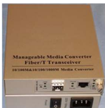
Standalone media converter (AZ03-100M-SFP)