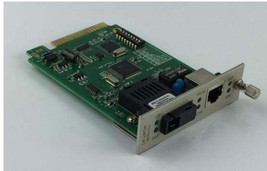
Card with fixed fiber port(AZ03-SFP-Card)